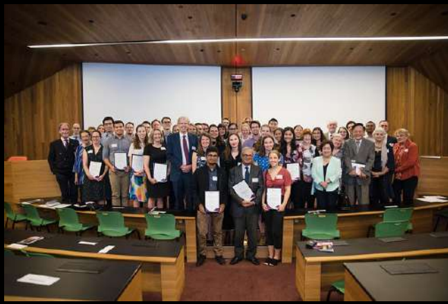
Group photo at the UQ Prizes and Scholarships Awards Evening, 16 th April, 2019