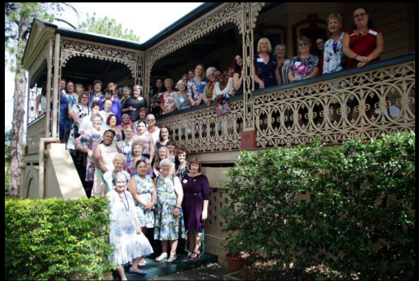
Group photo at the NMWQ/ QWHA event that was attended by a number of QMWS members.