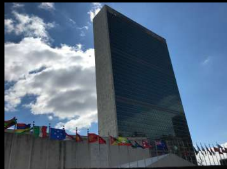
Photo to left: United Nations New York, where the Commission on the Status of Women (CSW63) was held March 2019.