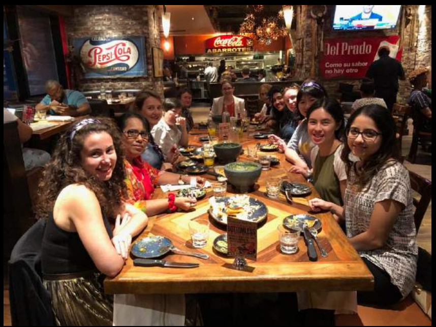
72nd World Health Assembly