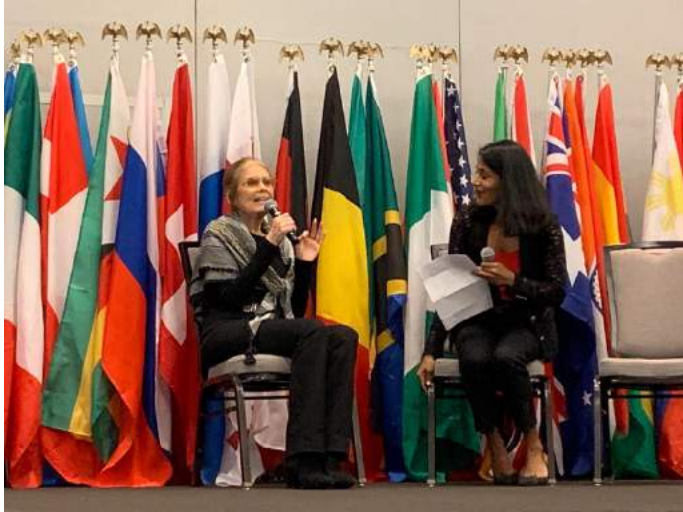
Keynote speaker Gloria Steinem at the centennial congress of the MWIA.

This year marks 100 years since the first meeting of the Medical Women's International Association. The Centennial Congress of the MWIA was held in New York from July 25-28. Among the registrants were 41 Australians including 17 Queenslanders. The theme for the 2016-2019 triennium was Medical Women – Ambassadors of Change. The keynote speaker for the Congress was Gloria Steinem – writer, lecturer, political activist and feminist organiser.